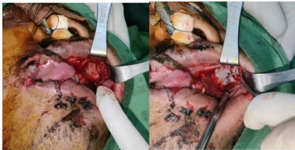
Figure 4. Repositioning and fixation of fractured bones.

aseptic and antiseptic actions were performed using povidone iodine in the area to be operated on. The patient's surgical area was covered using a sterile drape except for the mouth area. Next, the flap design was drawn intra-orally, then an incision is made using blade no. 15. The flap was then retracted using a raspatory until the fracture line was visible on the zygomatic bone. Then fractured bone was repositioned to its original position, then fixed with and installation of a 4-hole miniplate and screws around the fracture line (Figure 4). The flap was sutured back together using interrupted sutures. The next step was suturing the lacerations in the tongue and commissure area (Figure 5).