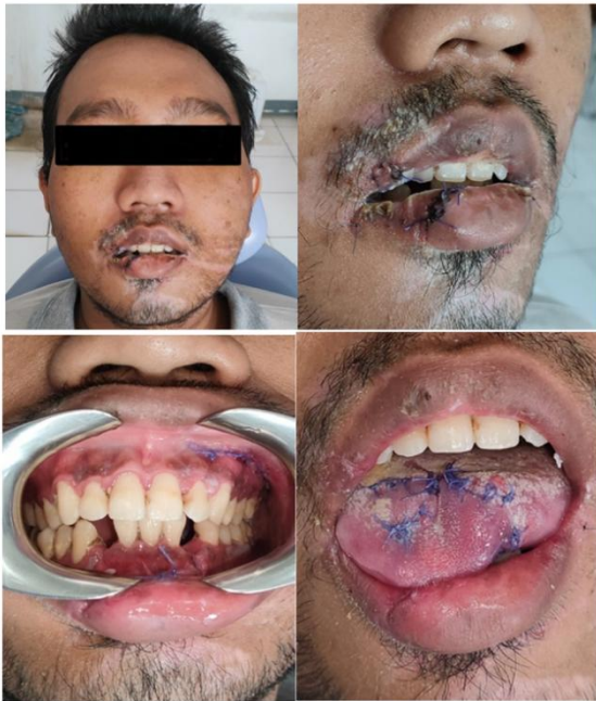
Figure 6. Patient condition during 1-week check-up

The patient then underwent suture removal (Figure 7). The patient then underwent a check-up again after one month to undergo ORIF removal.