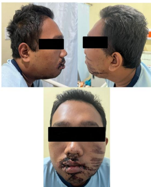
Figure 1. Extra oral image of the patient during initial examination.

Extraoral examination found an asymmetrical face, edema with abrasion wounds around the left cheek, mouth, nose, and chin (Figure 1). Intraoral examination showed laceration wounds on the right commissure and tongue (Figure 2). The supporting examination performed on the patient was a CBCT examination, with the results showing fracture lines on the left zygoma (Figure 3). The diagnosis determined for the patient was a fracture of the left zygoma accompanied by lacerations on the right commissure and tongue area, with multiple abrasive wounds.