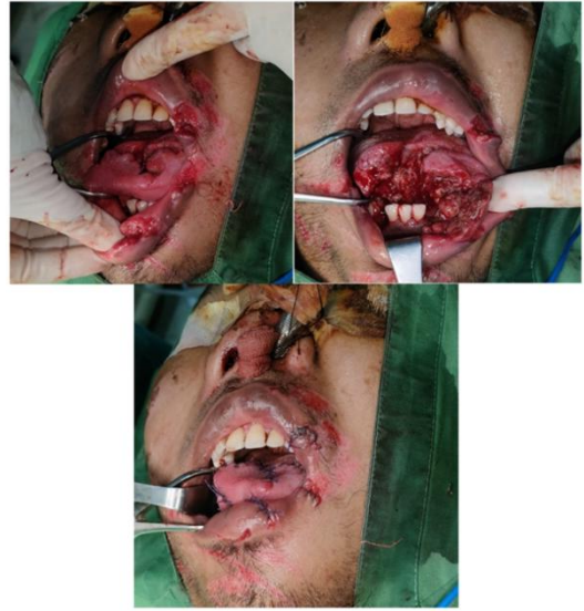
Figure 5. suturing of lacerations on the tongue and commissures

The patient was instructed to have a liquid diet for the first week. The medications consumed by the patient were antibiotics and analgesics. The patient was instructed to maintain oral hygiene and had to return to RSD Gunung Jati for a check-up on the 7 th day after the operation. The results showed that the laceration wound in the right commissure and tongue had closed, and no bleeding was found (Figure 6).