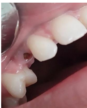
Figure 1. Clinical picture of residual root persistence of tooth 53.

The patient was a first-time visitor to the dentist and had never been treated before. The patient also admitted that an x-ray had never been taken before, so the patient wanted the tooth to be extracted and needed a radiographic image to support the treatment.