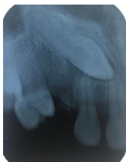
Figure 2. Periapical radiograph of the remaining root of tooth 53.