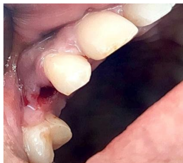
Figure 4. Clinical picture after extraction of the persistent residual root of tooth 53.

The operator is positioned in front of the patient, with the patient sitting on the dental chair upright and relaxed. The extraction forceps of the remaining root of the maxillary canine tooth are held using the right hand, and with the left hand, the operator fixes the gingival area of the tooth. Next, the extraction forceps are applied to tooth 53, then a slight palatal reduction is made, followed by a buccal reduction, and the tooth is pulled out of the socket. Once the tooth is extracted, check the sockets and massage the gingiva before the patient bites down on a sterile tampon with povidone-iodine. 14