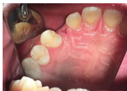
Figure 5. 1-week post-extraction clinical picture.

The third visit was at the time of control 1-week post-extraction. It was seen that the tooth socket had closed, was in good gingival condition, and had no post-extraction complaints in the area. So, further treatment can be carried out, where the patient can be given orthodontic treatment to pull the impaction of permanent canine teeth out to the maxillary dental arch.