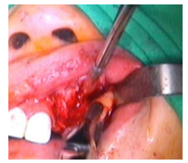
Figure 10. Removal impacted tooth