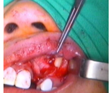
Figure 9. Impacted lateral canine.