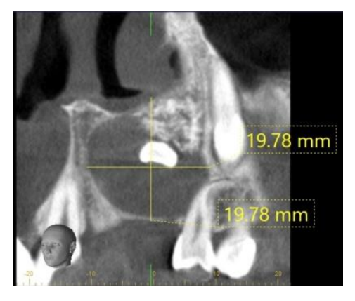
Figure 3. CBCT view.

CBCT confirmed well-defined, corticated, mixed radiolucent-radiopaque, with driven-snow appearance, fociradiopaque crescent shape on crown left lateral incisor (Figure 3, 4, and 5).