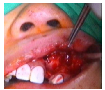
Figure 11 . Alveolar bone after enucleation