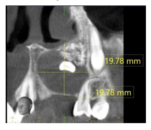
Figure 2. Panoramic view.

CBCT confirmed well-defined, corticated, mixed radiolucent-radiopaque, with driven-snow appearance, fociradiopaque crescent shape on crown left lateral incisor (Figure 3, 4, and 5).