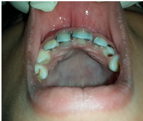
Figure 2. Intraoral examination showed swelling in the palatal of 11-13 tooth region.

The patient underwent a panoramic radiological examination that shows radiolucent on the mesial and distal of the crown 11-12 tooth from the enamel to the pulp. It was a radiopaque image resembling restorative material in the mesial and radiolucent on the distal of the crown of 13 teeth from the enamel to the pulp. There is a round radiolucent appearance on the periapical of the 11-13 roots of the tooth