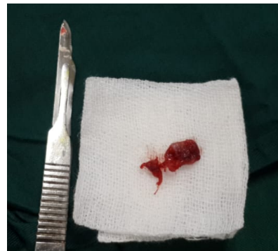
Figure 7. Specimen of cyst capsule with fistula.

On the fourth day of control, there was no complaint from the patient, the surgical wound was good, and the gauze was removed. On the seventh day of power, the patient histopathological examination result concluded an infected radicular cyst. There was no complaint; the surgical wound was good, then stitches could be opened. The patient came back for control in the sixth month without any complaints and signs of recurrence.