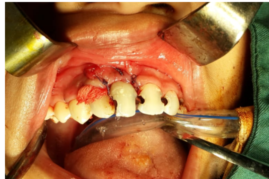
Figure 6. Wound cleaning and insertion of gauze into the hole.

to further examination at Pathology Anatomy (Figure 7).