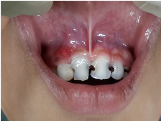
Figure 1. Intraoral examination showed a lump in the gum of the 11-12 tooth region with fistula.