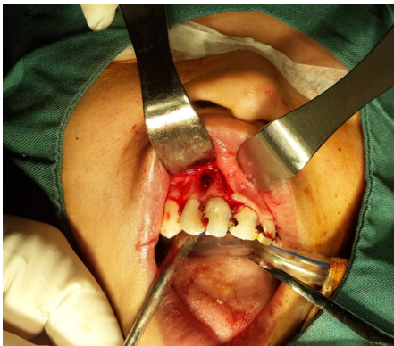
Figure 4. Post fistulectomy, fistula with bone base appear.

the fistula are performed on the labial side (Figure 4).