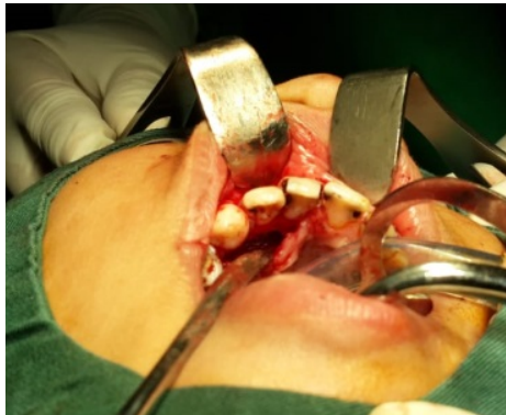
Figure 5. Post enucleation of the cyst on a palatal view.

Next, do a flap envelope on the palate of the 14-21 tooth region, dissect and find a cyst capsule wall with size 2x1,5x1,5 cm filled with pus, then explore and remove the cyst wall are performed (Figure 5).