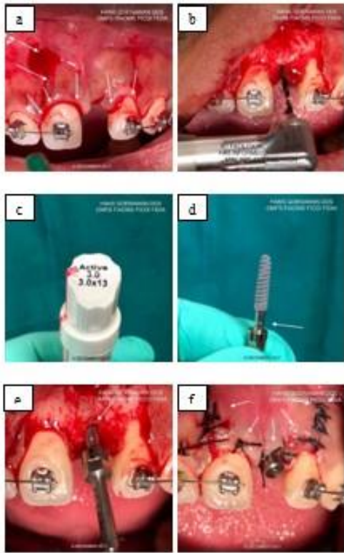
Figure 3. (a) trapezoidal flap incision, (b) drilling #21, (c) Nobel active implant 3.0x13.0 mm, (d) hold implant driver 3.0, put manual ratchet adapter, (e) implant insert manually, (f) tension-free suture and healing abutment.

Six months after implantation, the patient maintains the orthodontic braces to prevent any space from closing. For prosthetic treatment the arch wire was then cut and ready for prosthetic treatment. Healing abutment removed and preparation for impression. Orthodontic braces were wax boxed to prevent undercuts during the impression. Impression coping open tray installed. Double impression with imprint coping available tray inside impression material. Centric occlusion bite registration using putty impression material. Then,